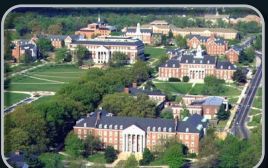
College Park, MD DET 335