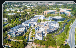
Mountain View, CA DET 818