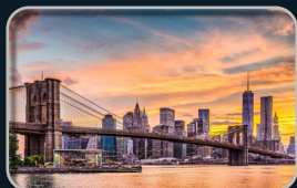
New York City, NY DET 125