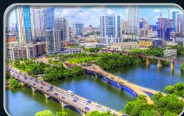
Austin, TX DET 440