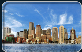
Boston, MA DET 123

Each of the Nation's centers of innovation has an assigned NSD: