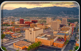
Colorado Springs, CO DET 817